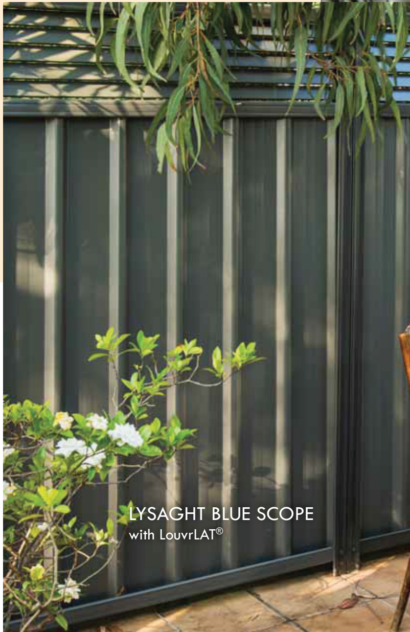
LYSAGHT BLUE SCOPE with LouvrLAT®

If you can't find the branding then the panels are not genuine COLORBOND® steel.