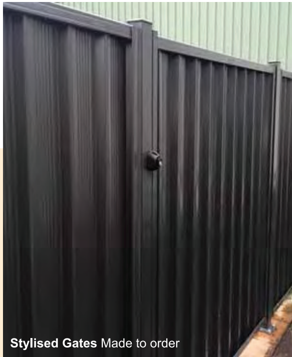
Stylised Gates Made to order